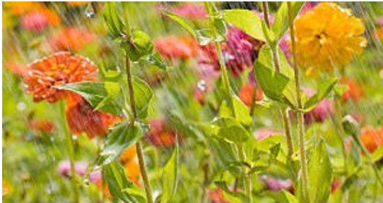
Record-breaking rainfall and all-time low sunshine hours made summer one of the wettest