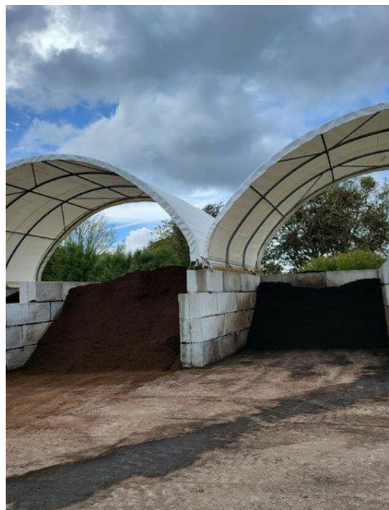
Covering the new bins with brilliant covers imported by Co Power